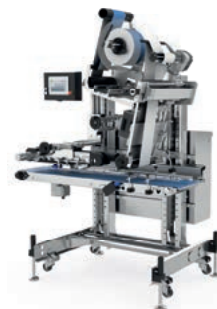
e.g. L 310 full wrap conveyor belt labeller