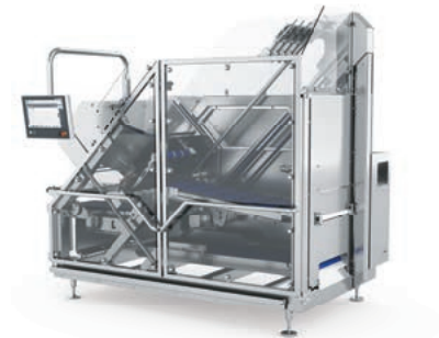
e.g. S 800 / S 1600 slicers

Reliability, durability and comprehensive service ensure that MULTIVAC remains a high-performance link in your production chain.