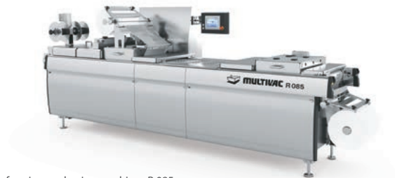
e.g. Thermoforming packaging machines R 085