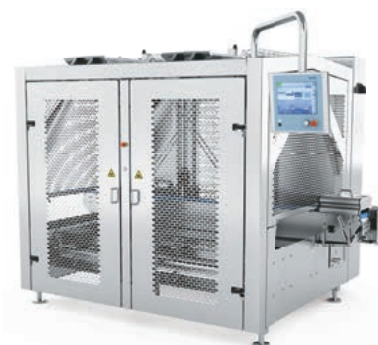
e.g. Handling module H 244